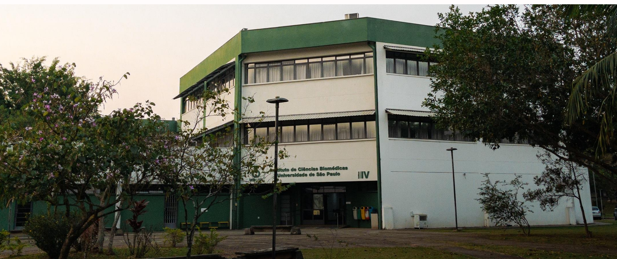
Instituto de Ciências Biomédicas (ICB)

Situated in Cidade Universitária in São Paulo, with additional facilities in Monte Negro (RO) and Acrelândia (AC), the institute comprises 7 departments and boasts a comprehensive infrastructure that includes over 150 laboratories. Presently, the ICB offers 5 Graduate Programs (PPGs).