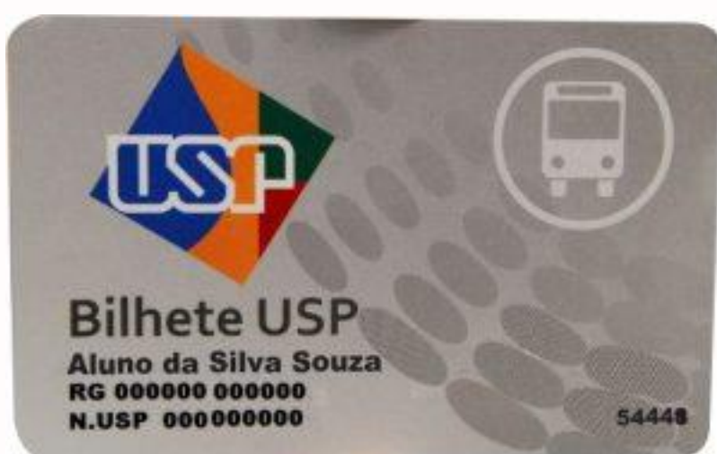
Bilhete USP (BUSP)

At Butantã Station, there is a bus terminal that offers access to the University City. You can take lines 8082-10 or 8083-10 and get off at the "ICB" stop. These lines are free for students who use the USP Ticket (BUSP), available after entering graduate school. Access the routes at the link .