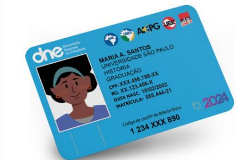
Bilhete Único de Estudante

As a graduate student, you are entitled to the Unified Student Ticket. It gives you the right to pay only half the fare for public transport. Consult your graduate office to find out how to apply for it.