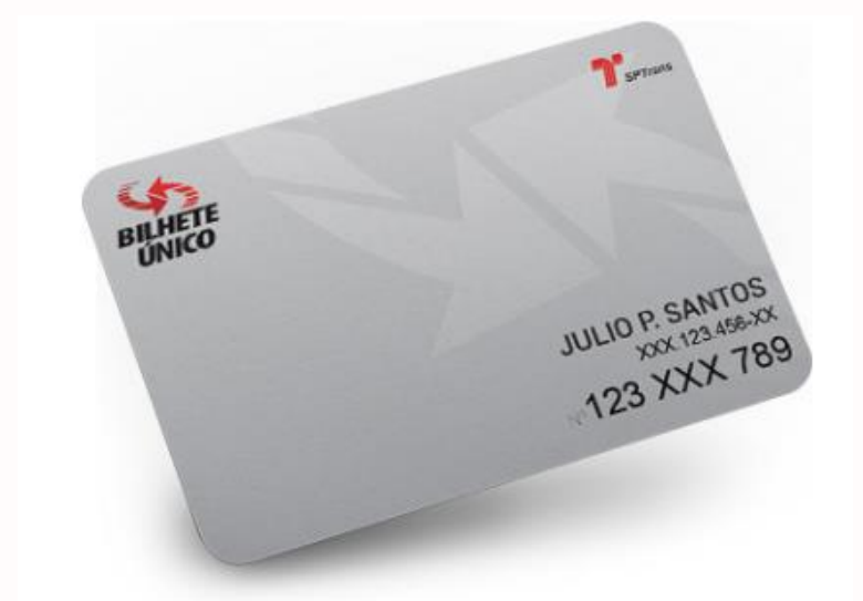
Bilhete Único Comum

The Bilhete Único is a practical way to pay for tickets in all the means of transport mentioned. To purchase it, you must register on the official website and then pick up the card at a service station. It can be recharged online or at various points around the city.